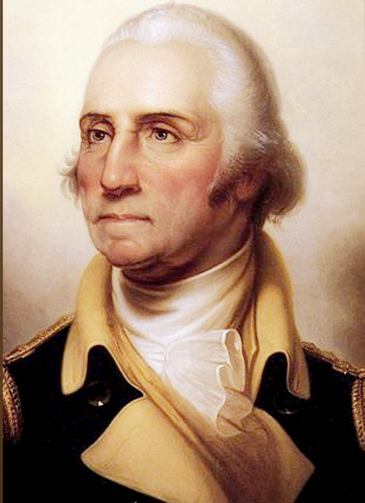
General George Washington

“No people can be bound to acknowledge and adore the invisible hand which conducts the affairs of men more than the people of the United States. Every step by which they have advanced to an independent nation has been distinguished by some token of Providential agency.”